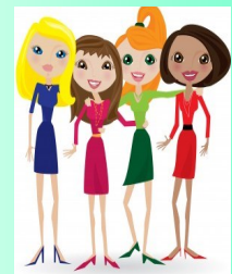
2019 LAH Club Board at monthly meeting in the Parks & Recreation