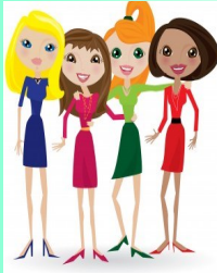
Photo Gallery of November 2019 Meeting